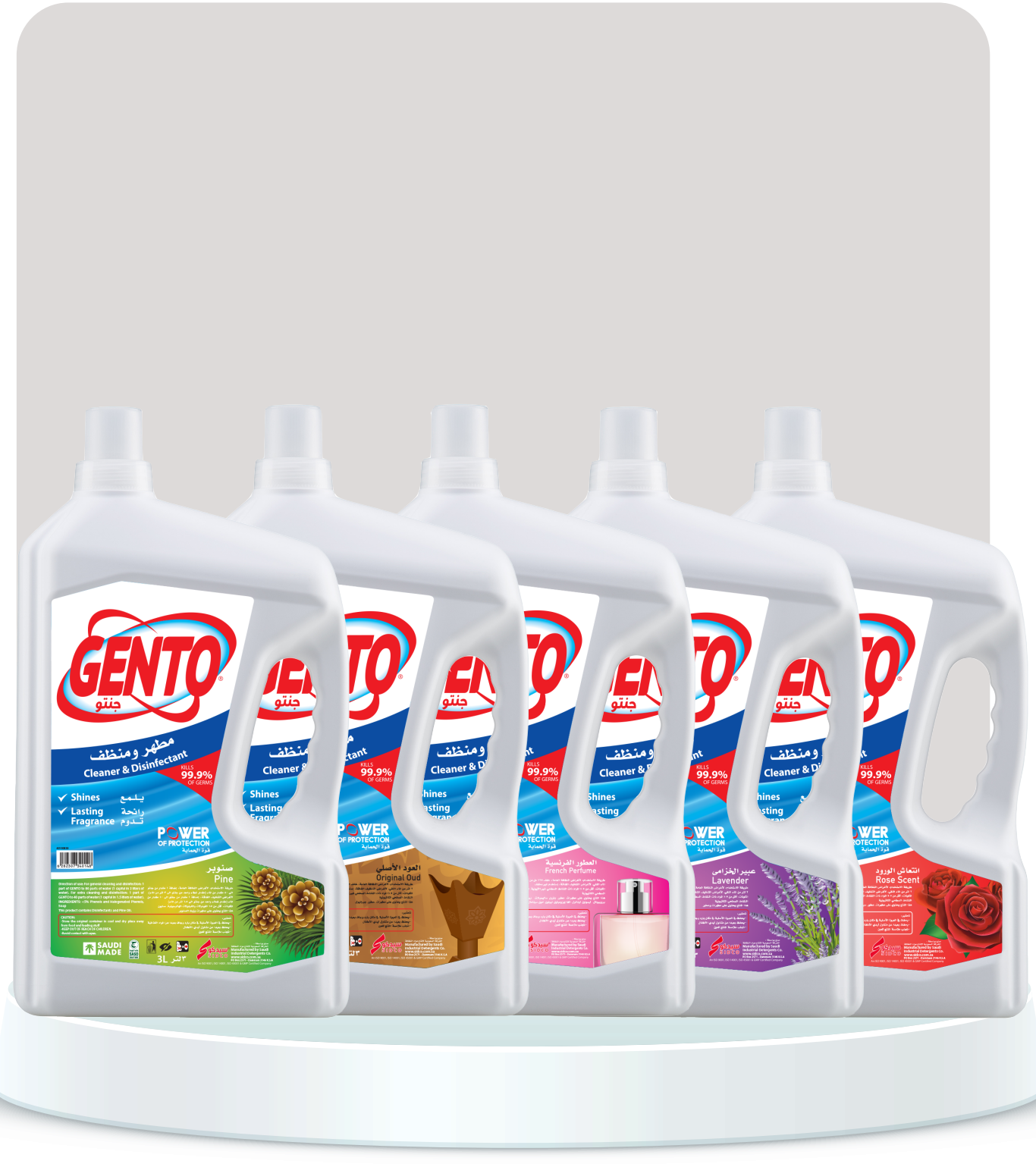
Packing: 1.5X12ml, 3X6L