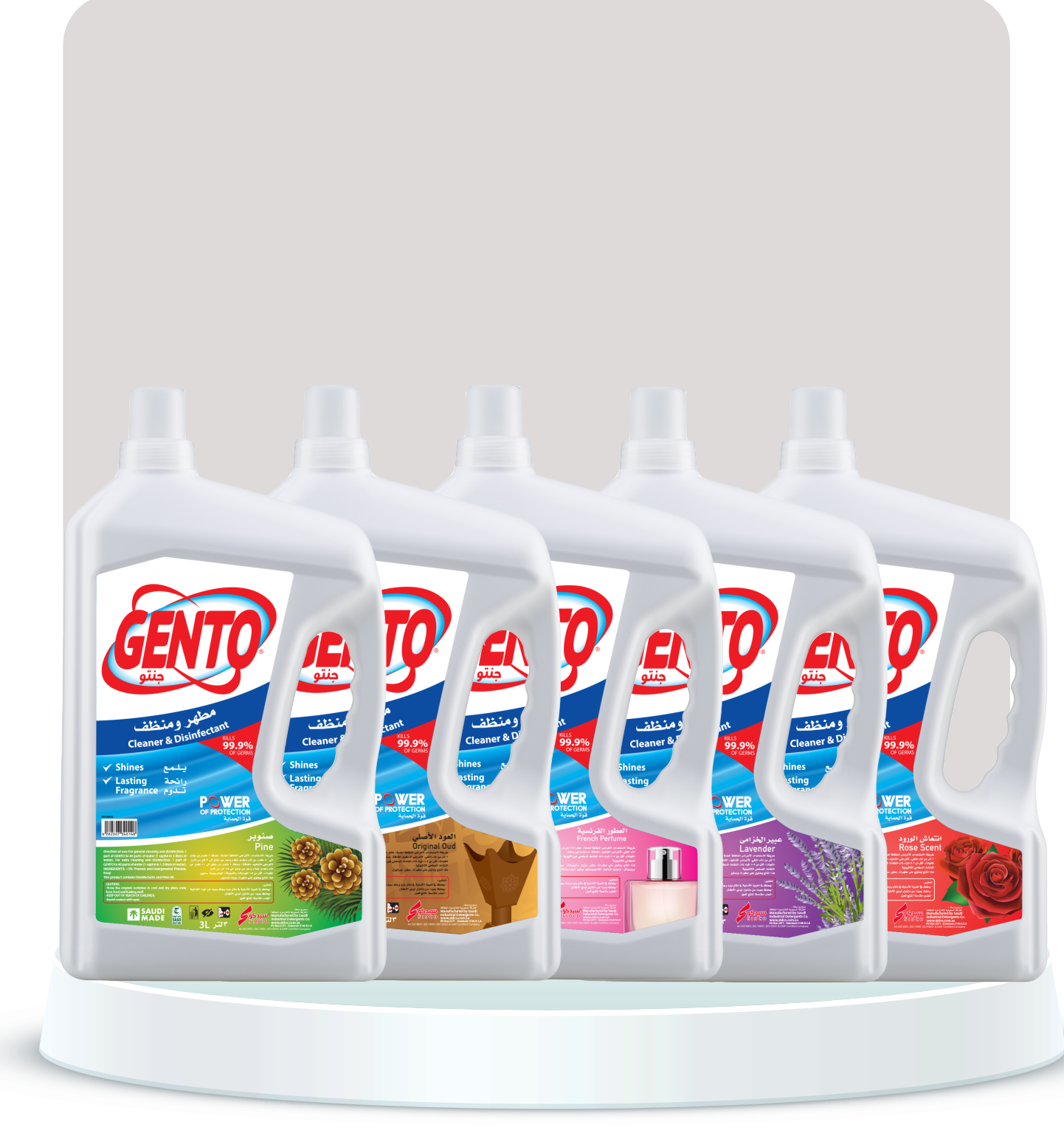
Packing: 1.5X12ml, 3X6L

ماء ، منشطات سطح غير أيونية ، كحول ثانوي ، مركب رباعي الألمنيوم ، إديتا ، مادة حافظة ، عطر ولون